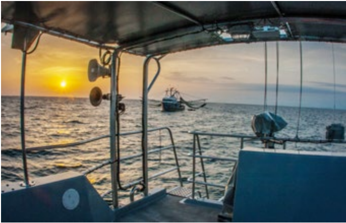
Amerger VII Fishing Vessel