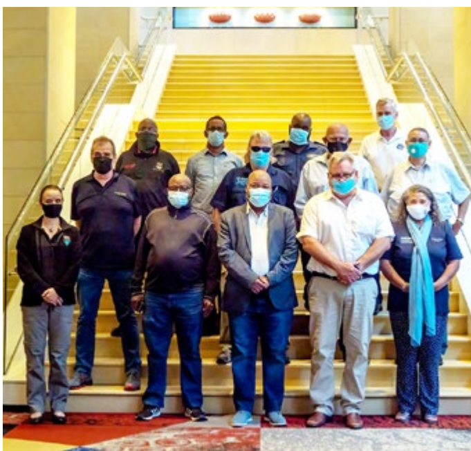
IUU PSMA Training for Senior Management 8 and 9 March 2021