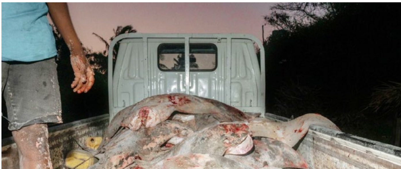
Mozambique Truckloads like this of rays are caught every day, all along the coast