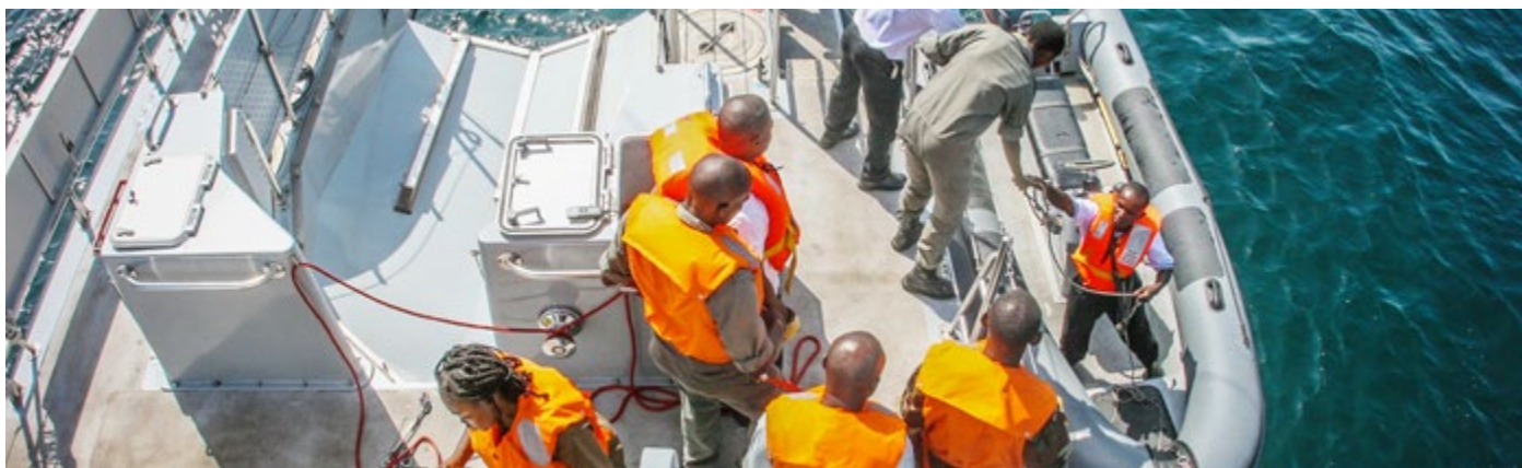
Fishing vessel inspection