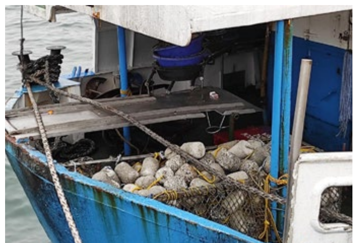
Images from a species identification course (May 2021), which included an offloading vessel inspection in Saldanha