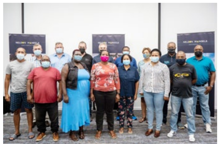
IUU PSMA Training 1–5 March 2021.