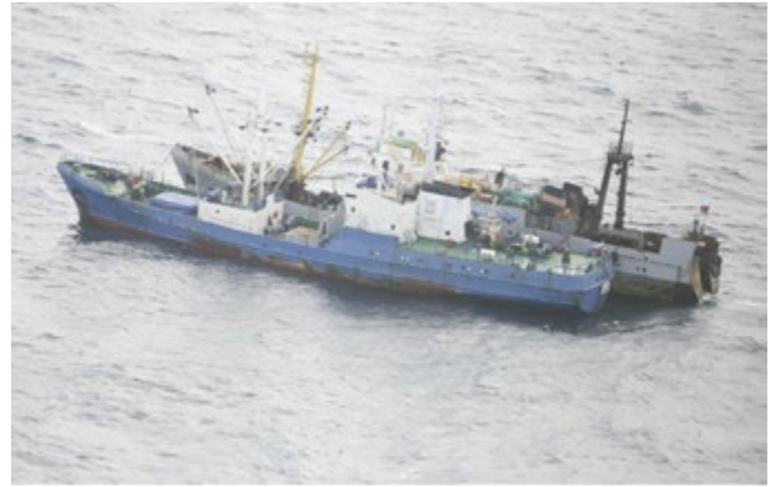
Transshipment of illegally caught fish taking place from one vessel to the other