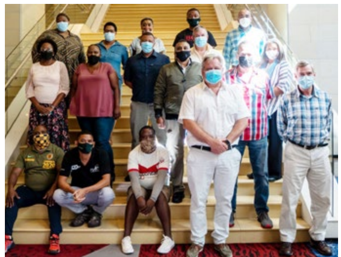
IUU PSMA Training 22–26 February 2021.

Participants were divided into groups according to the agency they represented, and each produced a Strength, Weakness, Opportunity, and Threats (SWOT) analysis, later combined into an overall SWOT analysis upon completion of the training courses. The participants also individually completed a Capacity Needs Assessment (CNA) which was used to formulate a combined CNA at the completion of all three training courses with the goal of developing a standard operating procedure to be used in South Africa through Operation Phakisa.