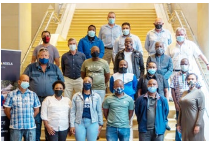
IUU PSMA Training 15 – 19 February 2021.